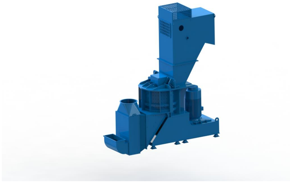
Fig. 1: MC-Serie

Combines impact crushing with systematic material shaping by granulation applications