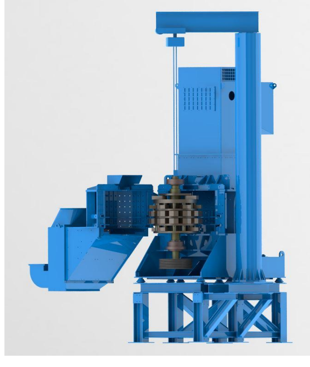
Fig. 4: Maintenance access

In order to protect people, machine and environment against fire caused by flying sparks, there is a fire detection and extinction system mounted at the outlet of the grinder mill. Spark detectors via infrared sensors detect glowing parts in the outlet material flow.